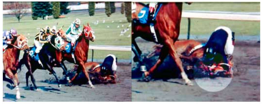
These photographs record an acute/sudden death EIPH incident in U S Quarter Horse Racing. The horses were moving at approaching 50 mph; the far horse is crashing to the track associated with an acute/sudden EIPH event, and the jockey is being thrown onto the track. The close-up, figure 2b, highlights the blood in the horse's exhalation, consistent with these events being triggered by an acute/sudden EIPH episode. Centennial Racetrack in Littleton, Colorado, altitude 5,389 ft.

Figures 2a and 2b: Acute/Sudden Death due to EIPH as an Equine and Jockey Safety Hazard