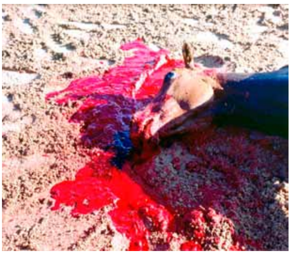
Figure 3: EIPH related sudden death, Thoroughbred racehorse, Ruidoso Downs, NM, mid 1980s.

deaths of horses on the racetrack are not infrequent occurrences, and when they do occur, they have immediate highly significant implications for the health and welfare of the horses and jockeys involved. Additionally, we must also keep in mind that when a horse goes down in a racing situation, there is always a statistical probability of following horses and jockeys becoming involved in the event, and this sequence of secondary events is more likely to occur in Thoroughbred than in Quarter Horse racing.